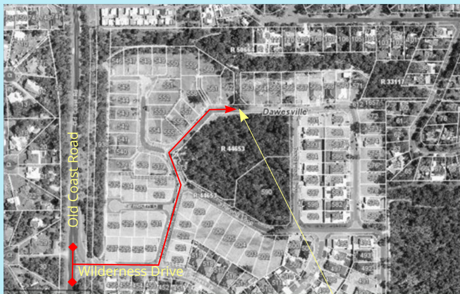
Gumnut Possum Bridge

* Bring covered footwear & a torch for Possum Spotting